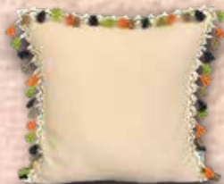
D078 40x40 45x45