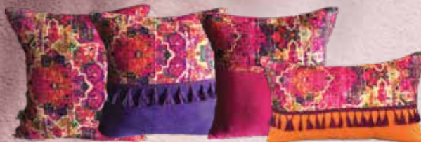
R008 R008B 90x30 120x30