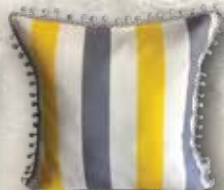
D030 40x40 45x45