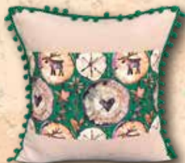
D002 40x40 45x45