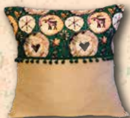
D003 40x40 45x45