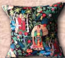
D077 40x40 45x45