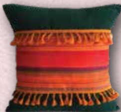
D057 40x40 45x45