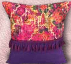
D043 40x40 45x45