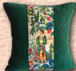
D084 40x40 45x45