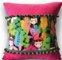
D067 40x40 45x45