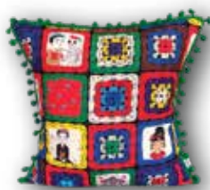
D110 40x40 45x45