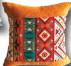
D011 40x40 45x45