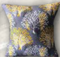
D028 40x40 45x45