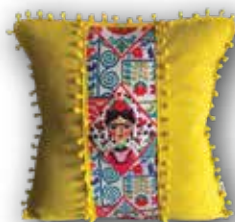
D090 40x40 45x45