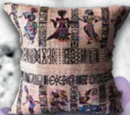
D099 40x40 45x45