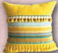
D114 40x40 45x45