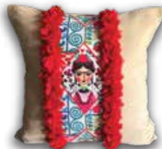
D093 40x40 45x45