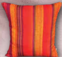
D054 40x40 45x45