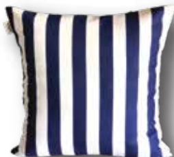
D061 40x40 45x45