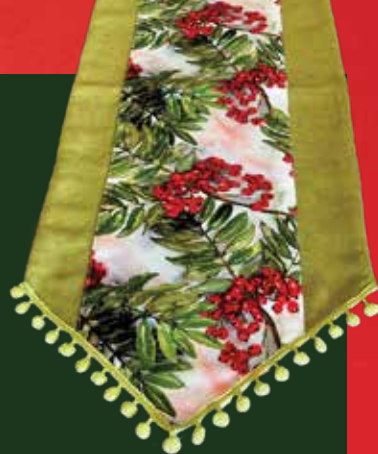
R016 90x30 R016B 120x30