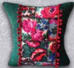
D106 40x40 45x45