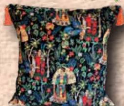
D076 40x40 45x45