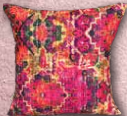
D042 40x40 45x45