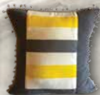
D034 40x40 45x45