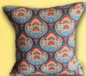
D117 40x40 45x45