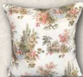
D095 40x40 45x45