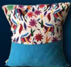
D119 40x40 45x45