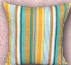
D113 40x40 45x45