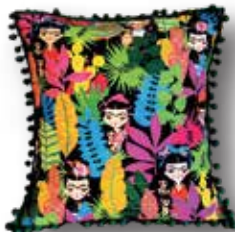
D065 40x40 45x45