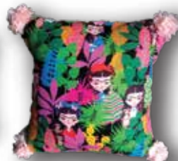
D070 40x40 45x45