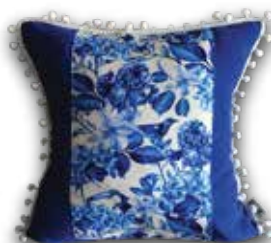
D022 40x40 45x45