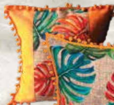
D006 40x40 45x45