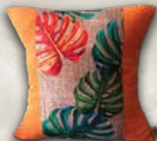
D007 40x40 45x45