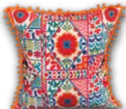
D086 40x40 45x45