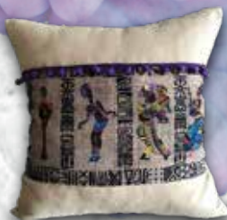
D102 40x40 45x45