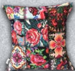
D103 40x40 45x45