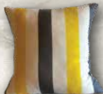
D031 40x40 45x45