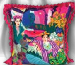
D024 40x40 45x45