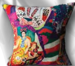
D025 40x40 45x45