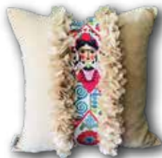
D091 40x40 45x45