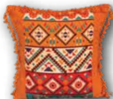
D014 40x40 45x45