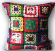
D109 40x40 45x45