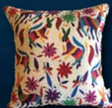
D122 40x40 45x45