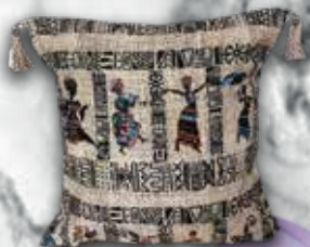
D098 40x40 45x45