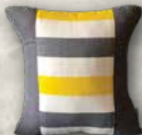
D033 40x40 45x45