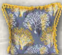
D027 40x40 45x45