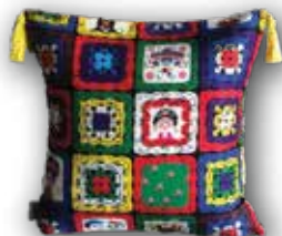
D108 40x40 45x45