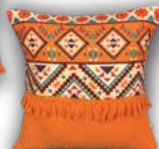
D013 40x40 45x45