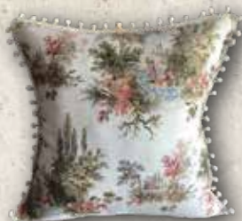
D094 40x40 45x45