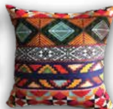
D019 40x40 45x45