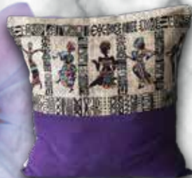
D100 40x40 45x45