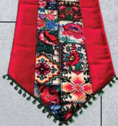
R028 R028B 90x30 120x30