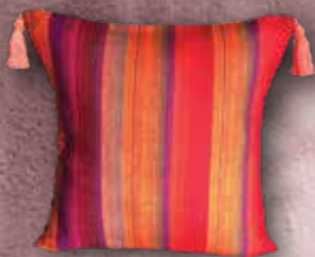
D053 40x40 45x45