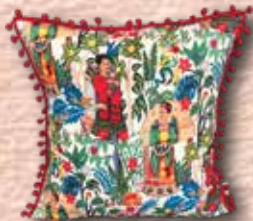
D080 40x40 45x45