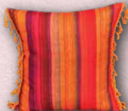
D058 40x40 45x45