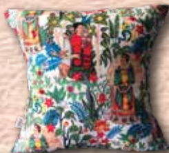
D081 40x40 45x45