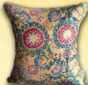
D115 40x40 45x45