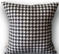
D036 40x40 45x45