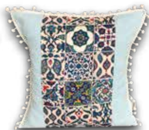
D125 40x40 45x45