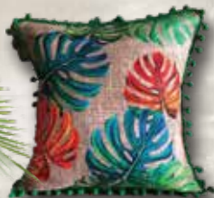
D004 40x40 45x45