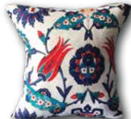
D062 40x40 45x45