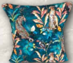
D016 40x40 45x45