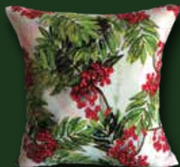
D047 40x40 45x45