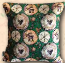
D001 40x40 45x45