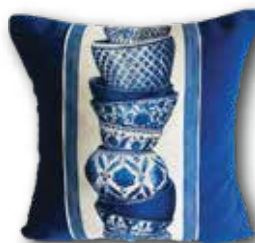
D023 40x40 45x45