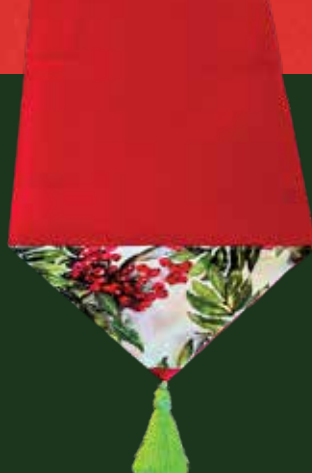
R009 90x30 R009B 120x30