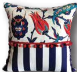
D060 40x40 45x45