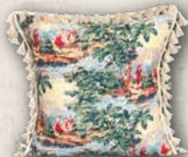
D097 40x40 45x45