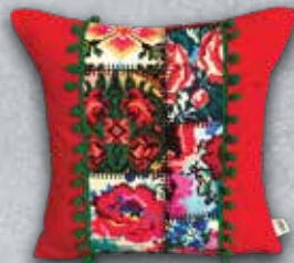
D107 40x40 45x45