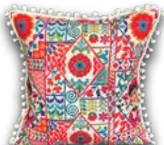
D0128 40x40 45x45