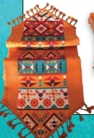
R004 R004B 90x30 120x30