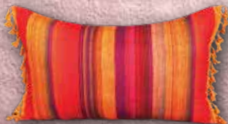
D059 50x30 45x45