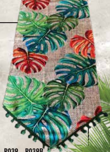
R039 R039B 90x30 120x30