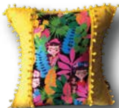
D068 40x40 45x45