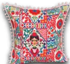
D0130 40x40 45x45