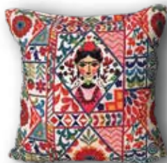
D085 40x40 45x45