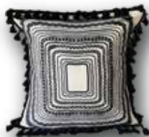
D041 40x40 45x45