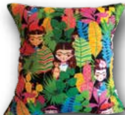
D066 40x40 45x45