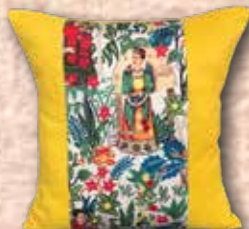
D083 40x40 45x45