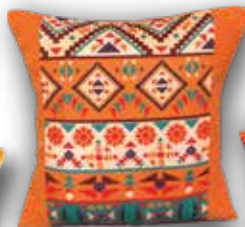
D012 40x40 45x45