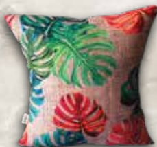
D005 40x40 45x45