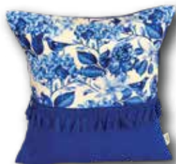
D021 40x40 45x45