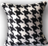
D039 40x40 45x45