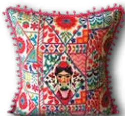
D0126 40x40 45x45