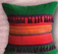
D056 40x40 45x45