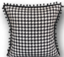
D035 40x40 45x45