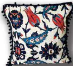
D063 40x40 45x45