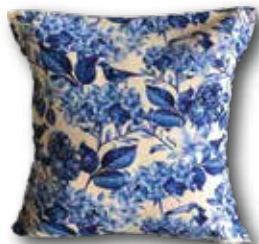
D020 40x40 45x45