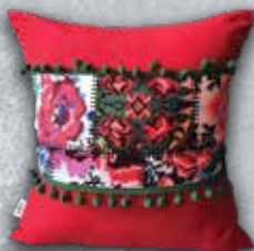
D104 40x40 45x45