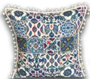
D0124 40x40 45x45