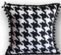
D038 40x40 45x45