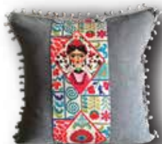
D088 40x40 45x45