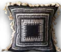
D0132 40x40 45x45