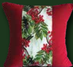
D048 40x40 45x45