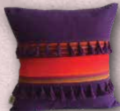
D055 40x40 45x45