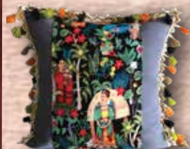
D072 40x40 45x45