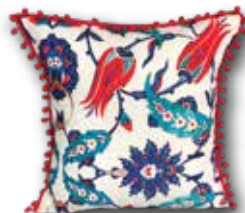
D064 40x40 45x45