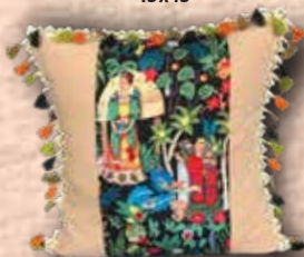
D079 40x40 45x45