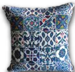
D123 40x40 45x45