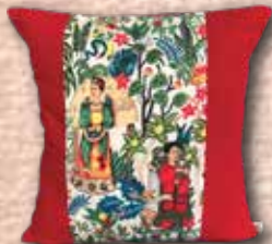
D082 40x40 45x45