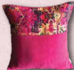
D044 40x40 45x45