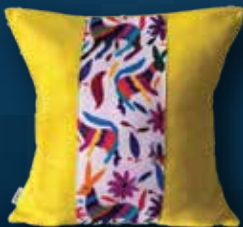
D120 40x40 45x45