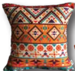
D010 40x40 45x45